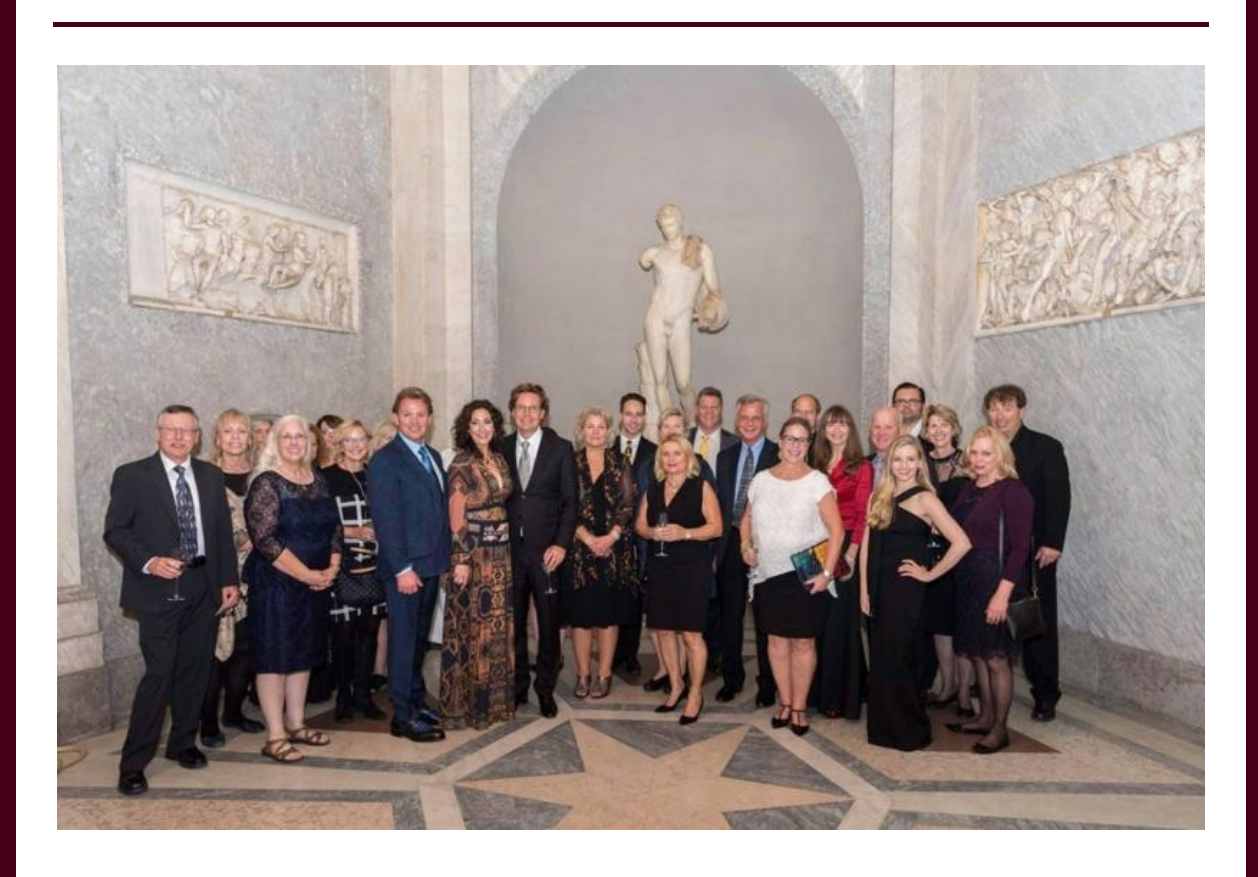
Restore History... Visit Rome Like Never Before...

Please email the NW Patrons if you are interested in booking a tour of the Vatican Museums.